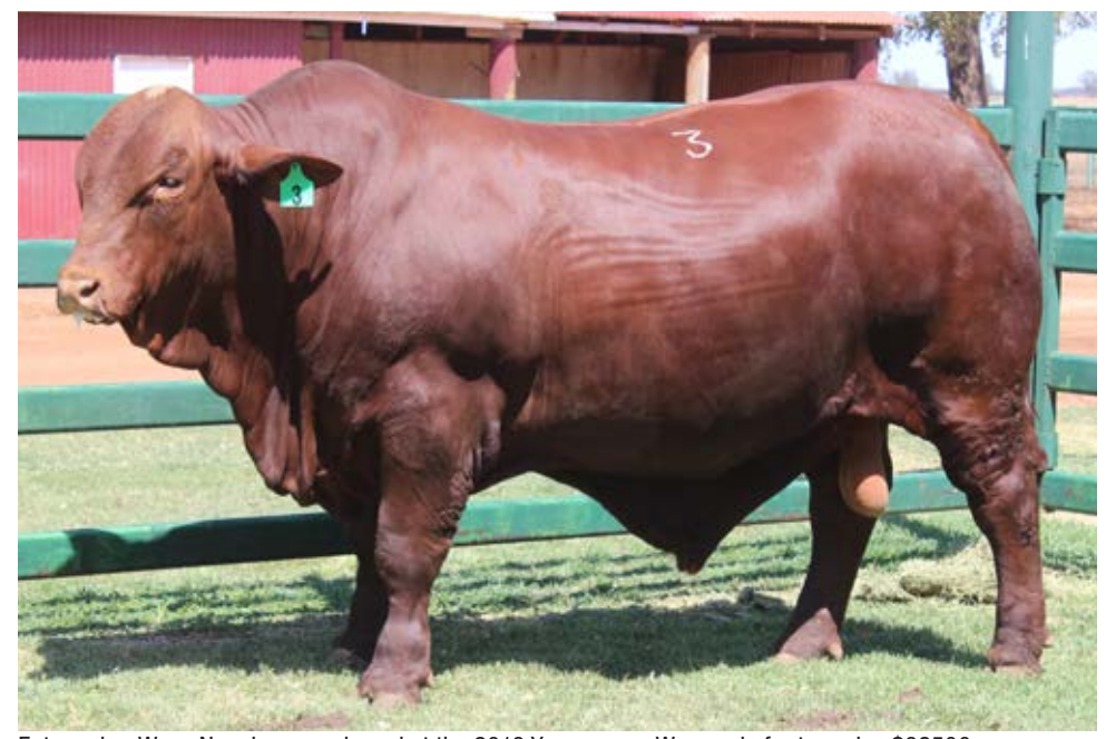
Future sire, Waco Napoleon purchased at the 2018 Yarrawonga Waco sale for top price $82500