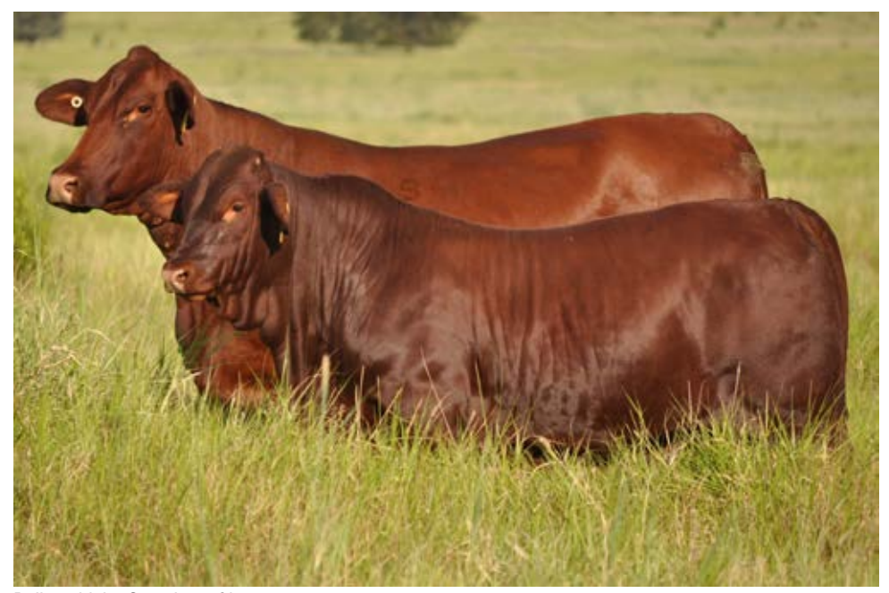
Bullamakinka C27, dam of lot 3