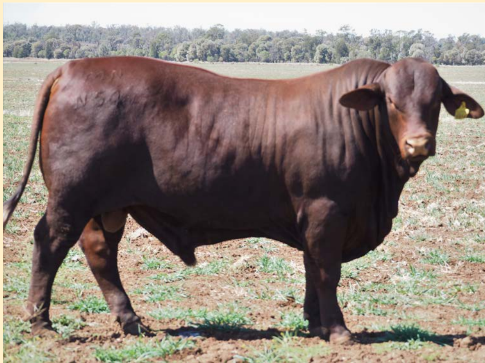
Bullamakinka Nick N54(P) (Top Selling Bull 2018 $57000 to Sylvia Kirkby, Warenda Stud)