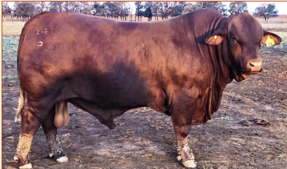
Retained Sire. Bullamakinka Patriot P2(P) Sire: Waco Flynn

Bidders not wanting to use Tablets/phones to bid will still have the ability to have our sale agents/Auctions Plus Representatives to register bids on their behalf if required.