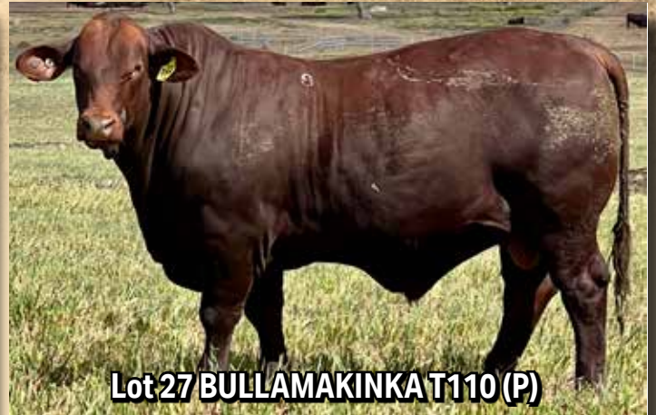
Lot 27 BULLAMAKINKA T110 (P)