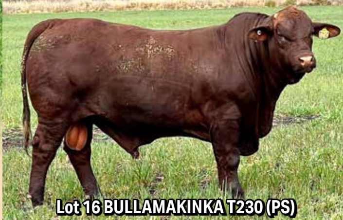
Lot 16 BULLAMAKINKA T230 (PS)