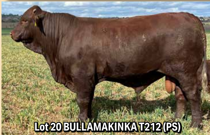
Lot 20 BULLAMAKINKA T212 (PS)