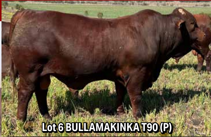
Lot 6 BULLAMAKINKA T90 (P)