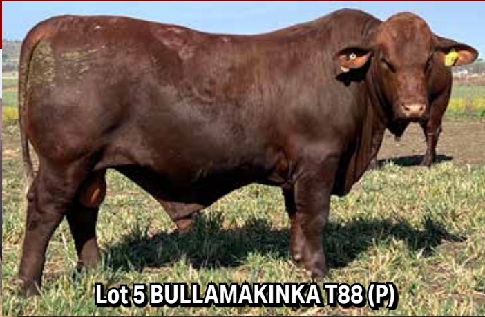
Lot 5 BULLAMAKINKA T88 (P)

Friday, 22 Sept 2023 11:30 am at the Longreach saleyards