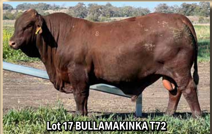
Lot 17 BULLAMAKINKA T72