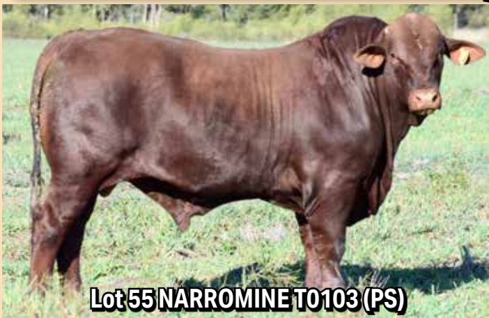
Lot 55 NARROMINE T0103 (PS)