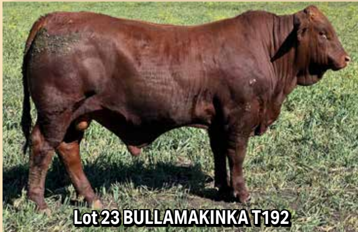
Lot 23 BULLAMAKINKA T192