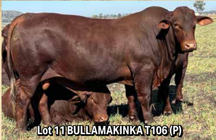
Lot 11 BULLAMAKINKA T106 (P)