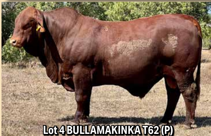
Lot 4 BULLAMAKINKA T62 (P)