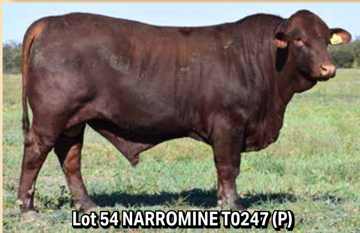
Lot 54 NARROMINE T0247 (P)