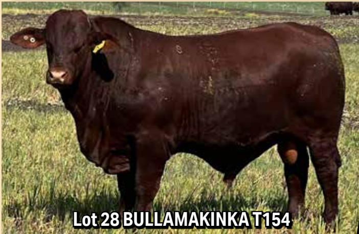
Lot 28 BULLAMAKINKA T154