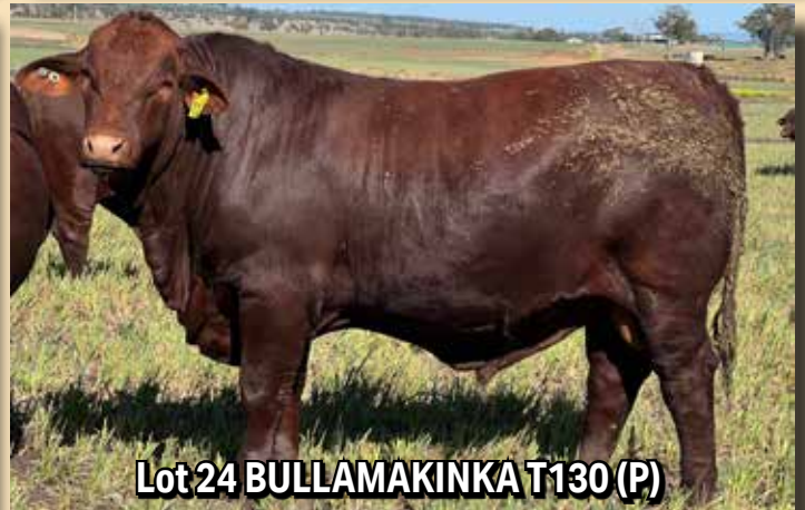
Lot 24 BULLAMAKINKA T130 (P)