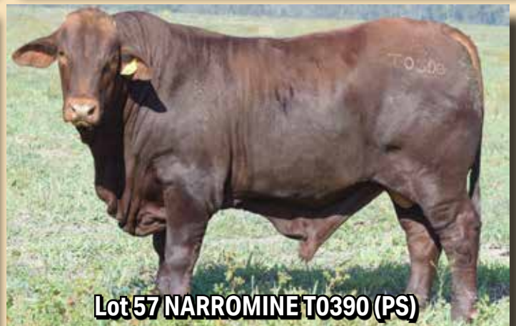
Lot 57 NARROMINE T0390 (PS)

Bull walk days 31 Aug and 10 & 11 Sept at Bevell-Dean, 4368 Gore Highway, Pittsworth, QLD