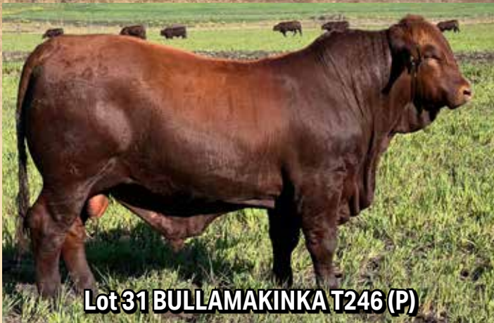
Lot 31 BULLAMAKINKA T246 (P)