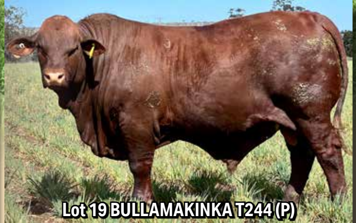
Lot 19 BULLAMAKINKA T244 (P)