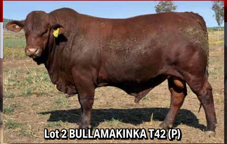
Lot 2 BULLAMAKINKA T42 (P)