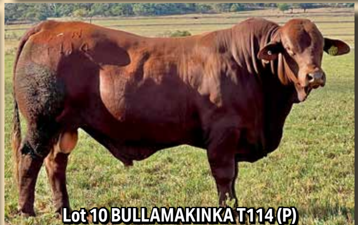
Lot 10 BULLAMAKINKA T114 (P)

Catalogue, videos, photos and sale info updated online at www.bullamakinka.com.au and AuctionsPlus. Pre-sale Inspections welcome.